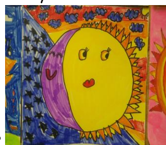
"Happy Moon and Sun" Kaleigh Fleischman Grade 3

The show extended for 3 weekends with the culminating weekend part of the